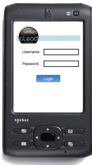
Log in screen